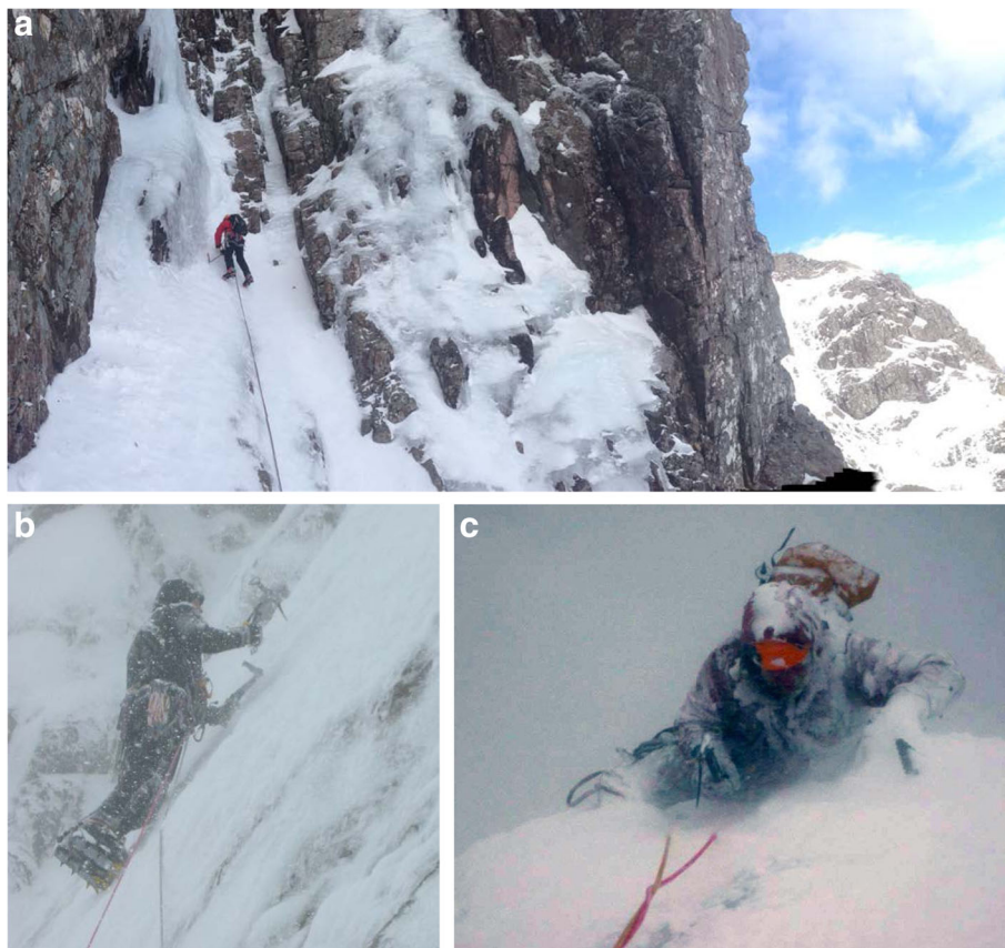
Fig. 1 Photos of winter climbing in Scotland: a Boomer's Requiem, Ben Nevis. b Hadrian's Wall, Ben Nevis. c Smith's route, Ben Nevis.

Data analysis was performed in Microsoft Excel. Inclusion criteria: winter climbers. Exclusion criteria: incomplete