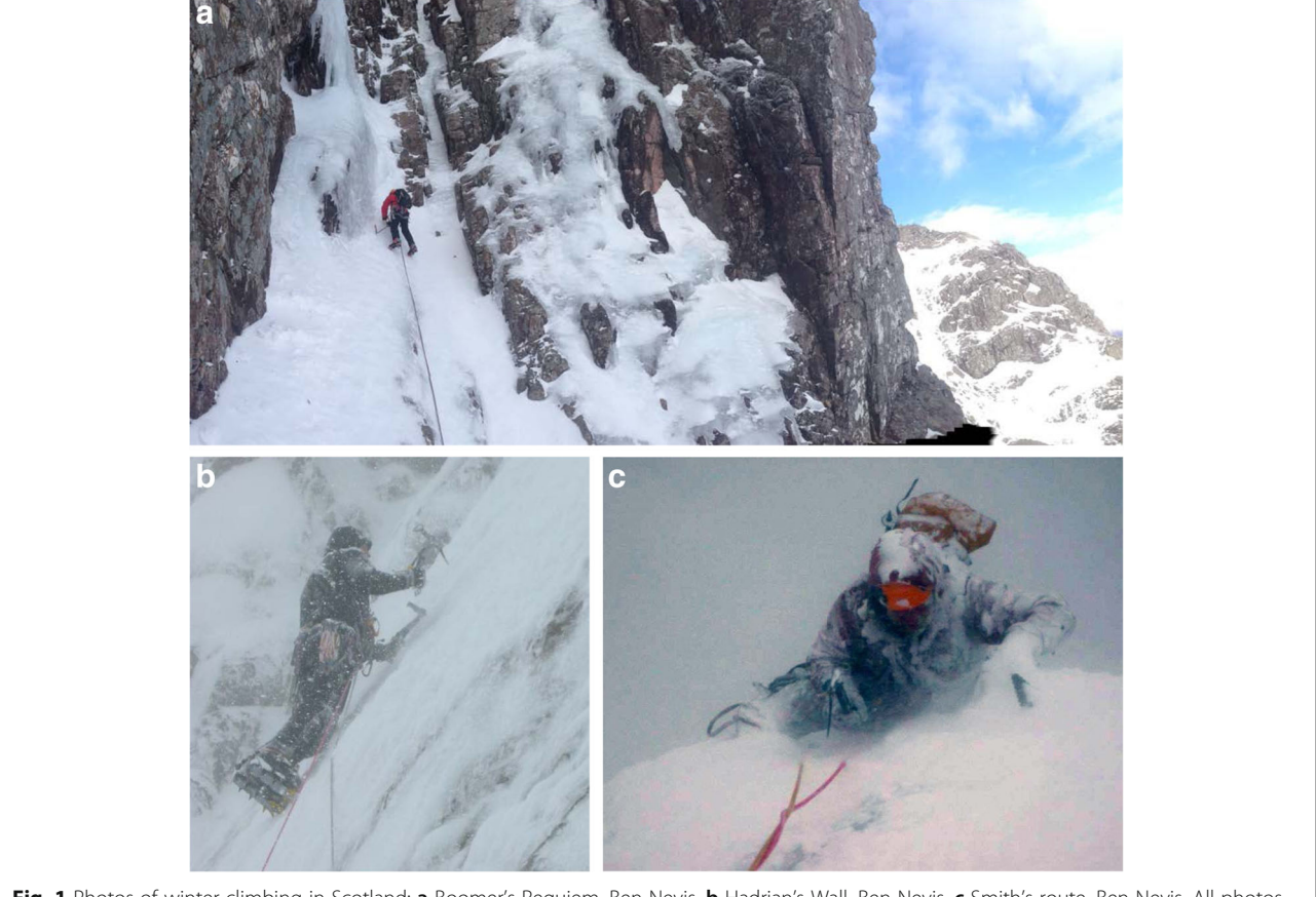
Fig. 1 Photos of winter climbing in Scotland: a Boomer's Requiem, Ben Nevis. b Hadrian's Wall, Ben Nevis. c Smith's route, Ben Nevis.

Data analysis was performed in Microsoft Excel. Inclusion criteria: winter climbers. Exclusion criteria: incomplete